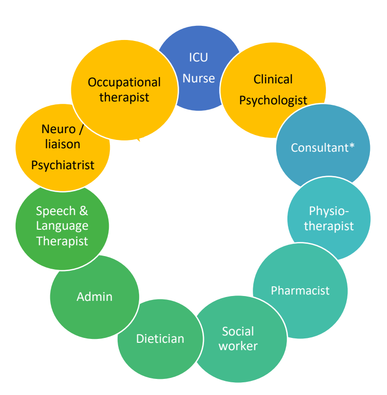
* Typically an Intensive Care Consultant with input from Rehabilitation Medicine Consultant where available.

Primary care and Community services have a very significant part to play in supporting both patient and family across the recovery trajectory. In the coming year, GPs are likely to encounter a substantial expansion in ICU survivor caseload. This highlights a requirement to improve links and information sharing between primary care and secondary/tertiary care. The changes to the NHS Standard Contract for 2017-19 define the responsibility of the provider of commissioned services and these are key for any provider of an outpatient service to ensure good practice for patient care and to maintain a good working relationship with local GPs<sup>22</sup>.